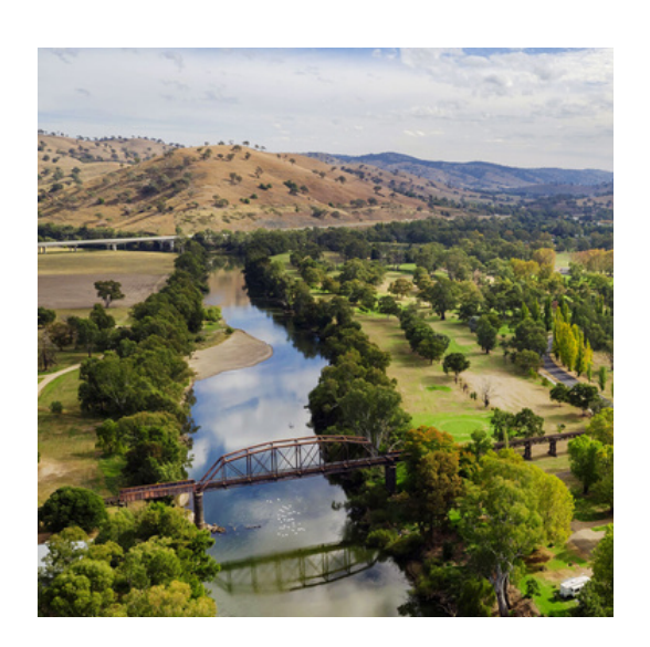
Homeward Bound Day 7 - Sunday 30th March 2025 (BL)

Quality Hotel Wangaratta Gateway | 03 5721 8399 Breakfast and dinner at the hotel | Lunch at Fowles Wine