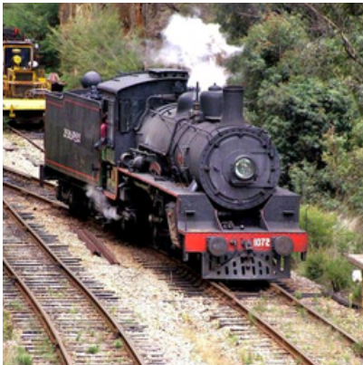
Zig Zag Railway Thursday 27 February 2025

This 3 day tour where you soak up heritage and scenery of Australia's historic rail adventure. Experience the magic of the steam train and the beautiful Blue Mountains . Enjoy a relaxing ride on the nostalgic and impressive steam locomotive as it hauls you over the Great Lithgow Zig Zag .