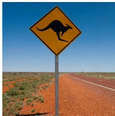
3 Day Mystery Tour Tuesday 1 April 2025

$2495 pp Twin/Double Share $3075 Sole Occupancy