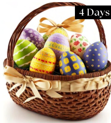
Griffith Easter Tour Friday 18 April 2025

$5795 pp Double $5999 pp Twin $6795 Sole Occupancy