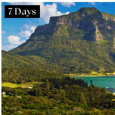
Lord Howe Island Tuesday 8 April 2025

$1650 pp Twin/Double Share $1810 Sole Occupancy