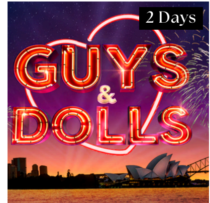
Guys & Dolls Saturday 5 April 2025

$1375 pp Twin/Double Share $1575 Sole Occupancy