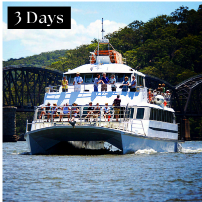
Riverboat Postman Monday 10 March 2025

Cruise the Hawkesbury River aboard the last Riverboat Postman . View the magnificent scenery as we deliver mail to the isolated settlements dotted along the waterways. On this 3 day tour be captivated by anecdotes of river life and experience, a tradition that still continues to this day and beyond.