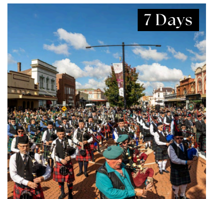
Australian Celtic Festival Wednesday 30 April 2025

$1990 pp Twin/Double Share $2290 Sole Occupancy