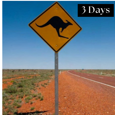
3 Day Mystery Tour Tuesday 1 April 2025

$1220 pp Twin/Double Share $1426 Sole Occupancy