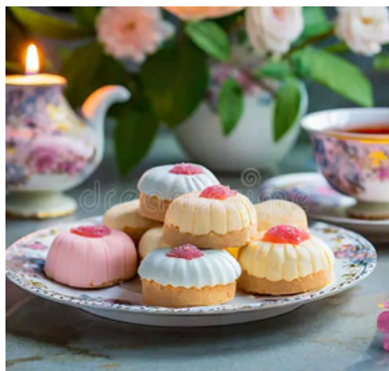
Mothers Day High Tea Thursday 8 May 2025

Celebrating all Mums, Mimi's & Gma's! Enjoy a Traditional High Tea followed by a stroll through the main street for some Boutique Shopping in the picturesque town of Picton . Includes Sandwiches, Hot Canapes, Macaroons & Tarts, Scones with Jam & Cream and Bottomless Tea Pots.