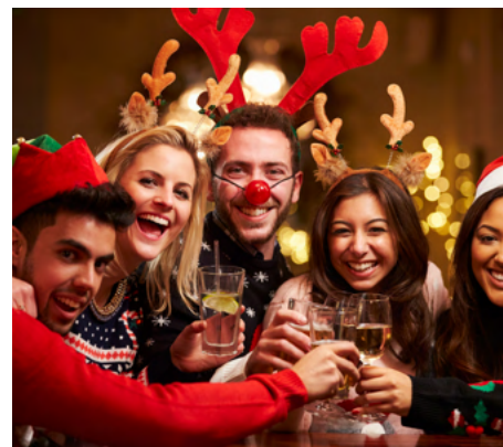
Christmas in July at Eling Forest Winery Friday 25 July 2025

Escape to the charm of the Southern Highlands and experience the magic of Christmas in July at Eling Forest Winery!