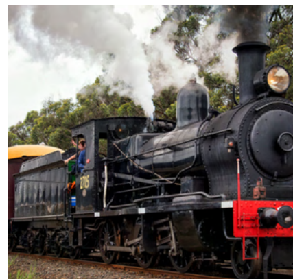
Heritage Rail Saturday 24 May 2025

Attention all you train buffs! Enjoy a Saturday drive as we travel to Thirlmere where we enjoy morning tea on arrival at the NSW Rail Museum . All aboard for a 40 minute steam train ride . We enjoy lunch at the Rail Museum with free time before returning home after an enjoyable day out.