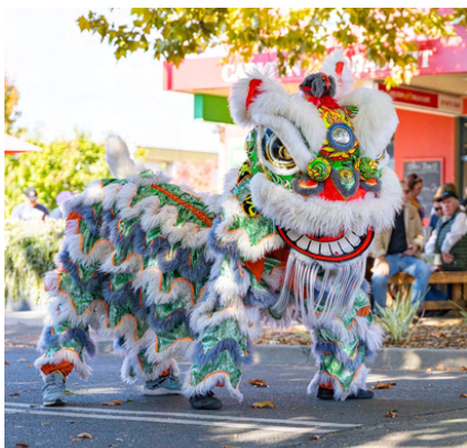
Falling Leaf Festival Saturday 26 April 2025

The Falling Leaf Festival is a celebration of everything that Tumut and surrounds has to offer at this magical time of year. Delicious food and drinks, market stalls , live theatre, roving entertainment and much more; the Festival is the perfect way to celebrate Autumn in the foothills of the Snowy Mountains .