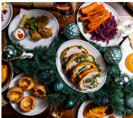
Christmas in July at Binalong Hotel Thursday 3 July 2025

Get ready for a festive feast in the heart of winter! Join us at the Binalong Hotel for a Christmas in July lunch that will warm your belly and lift your spirits.