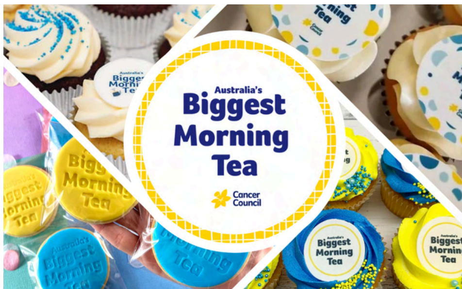
Australia's Biggest Morning Tea Thursday 12 June 2025