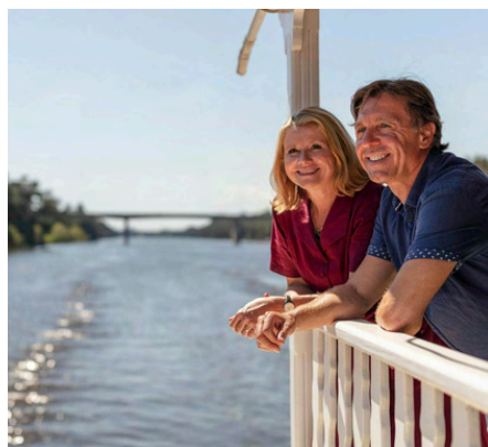
Nepean Belle Paddlewheeler Luncheon Thursday 14 August 2025

Step aboard the Nepean Belle Paddlewheeler for a scenic luncheon cruise like no other! Glide along the breathtaking Nepean River, take in the stunning Blue Mountains backdrop, and enjoy a delicious meal while soaking up the serene atmosphere.