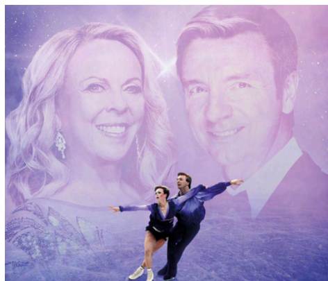
Torvill & Dean: Last Dance Tour Sunday 22 June 2025

After three decades, legends of the ice, Torvill & Dean are set to make their long-awaited return to Australia for a final farewell tour . Don't miss the world's most famous skating superstars in action - 50 years since they formed their incredible skating partnership. This Arena Spectacular is at Qudos Bank Arena , Sydney Olympic Park.