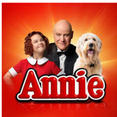
Annie the Musical Wednesday 11 June 2025

The beloved tale of Annie has been capturing the hearts of theatre goers for generations. It's one of the most awarded musicals of all time. With it's iconic score. Featuring classics like 'It's the Hard-Knock Life' , 'Tomorrow' and 'Easy Street' , Annie is truly a timeless masterpiece.